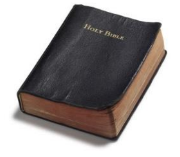
The Bible is the Word of God